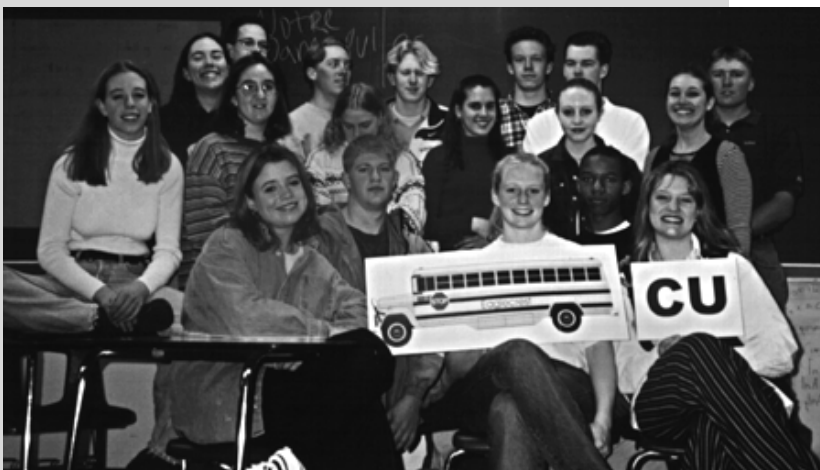
Students from Eaglecrest High School pose for a trip picture.