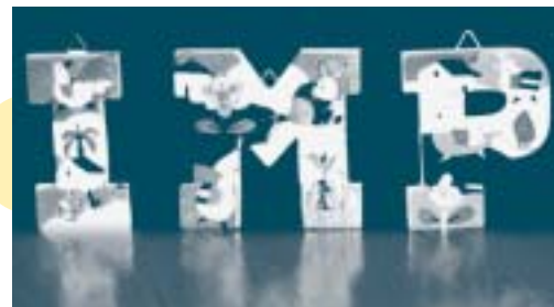
The next generation begins with IMP.

Making IMP a success involves more than teachers and students. It also involves the larger education community of parents, administrators, and other stakeholders. The grant will strengthen the dissemination and implementation aspects of IMP by developing new materials about all aspects of IMP that will inform and address the